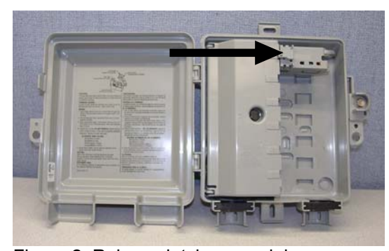
Figure 2: Release latch on modular jack.